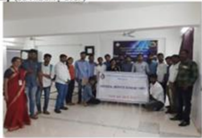
Candle March and CRPF Fund Raising Program (20 February 2019)